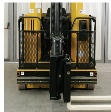
The Pantograph closed.