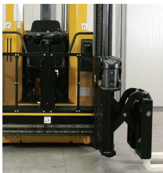
The Pantograph open.