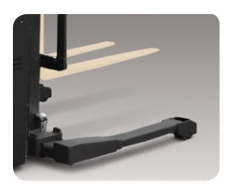
Straddle legs are adjustable