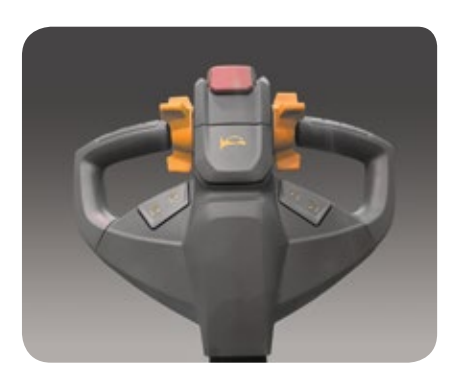
Handle (standard) left and right handed