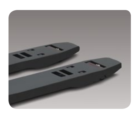
Entry roller for easy operation