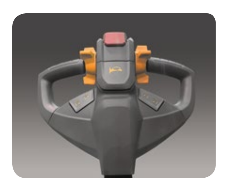
Handle (standard) left and right handed