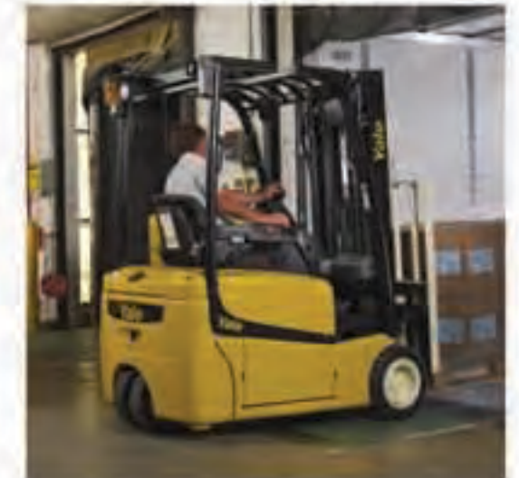
Selectable performance modes