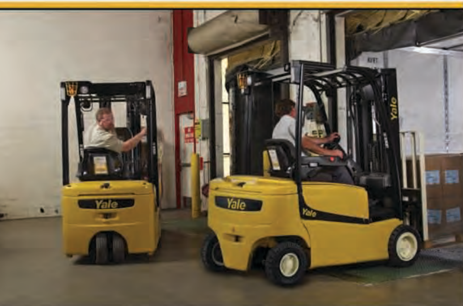
All trucks shown with optional equipment

Performance and productivity are standard equipment on every Yale® truck. With the ERP-VT/VF series, productivity cost savings are achieved through lower truck operating expenses, reduced maintenance costs, extended maintenance intervals, and increased throughput.