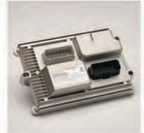
Intellix Vehicle Systems Manager

Power Assisted Braking helps reduce stress on key drive unit and braking components, increasing component life. Auto Deceleration System reduces the demand on the brakes, further improving brake life.