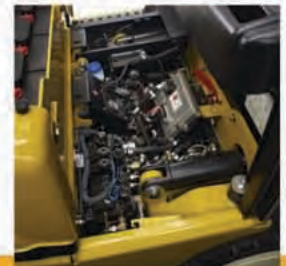
Easy service access