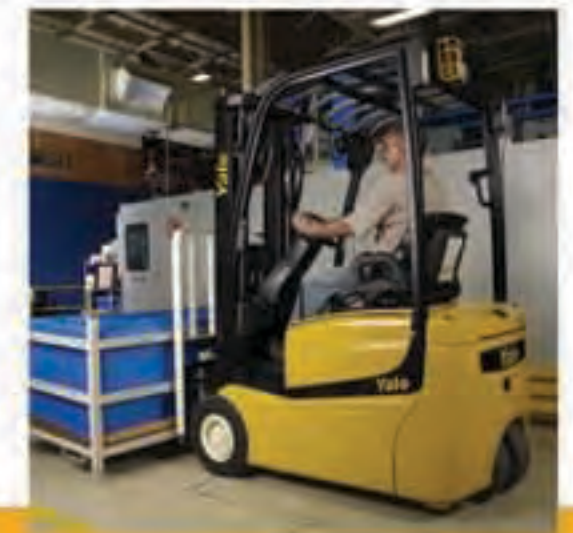
Automatic park brake