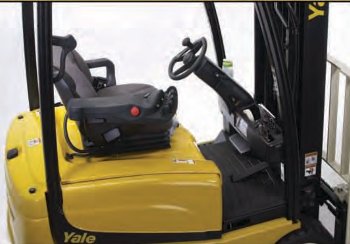
All trucks shown with optional equipment

Operators prefer Yale® trucks. Operator comfort enhances productivity and reduces fatigue. With maximized visibility, smooth, precise mast positioning, low-effort steering, and “human-engineered” operating controls, everything about these trucks makes them easy to operate.