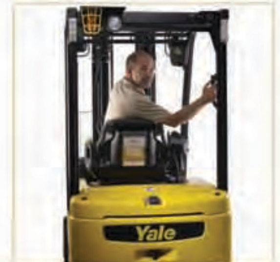
Rear driving comfort