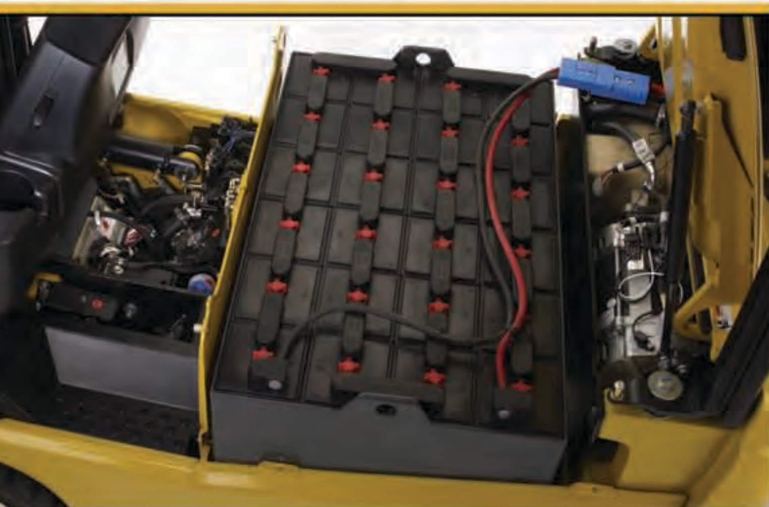
All trucks shown with optional equipment

Not only is the ERP-VT/VF series designed to require less maintenance; it is also designed to be extremely easy to service. The rear-opening, one-piece steel hood and the on-board diagnostics of these trucks is designed with service details in mind. The outstanding component access makes servicing fast, easy, and convenient. It's the new standard in truck serviceability.