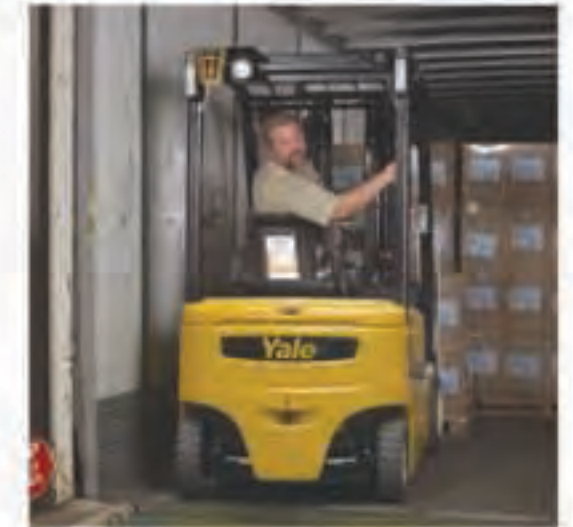
Longer battery run time

The Automatic Park Brake automatically sets when the truck stops, simplifying motions for the operator.