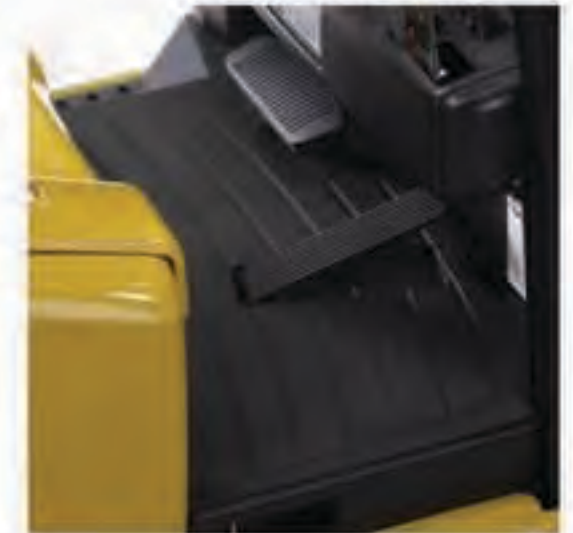
Superior floor space

The optional Yale Accutouch minilever electro-hydraulic controls with thumb activated directional control offer an excellent ergonomic design with shorter reach and throw and considerably less effort required to operate versus mechanical hydraulic levers. The fully-adjustable armrest with palm rest is contoured for maximum comfort.