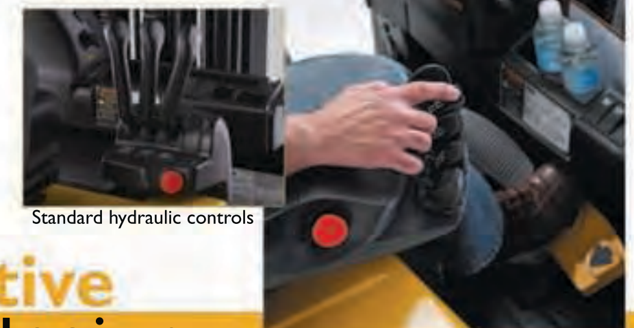
Standard hydraulic controls