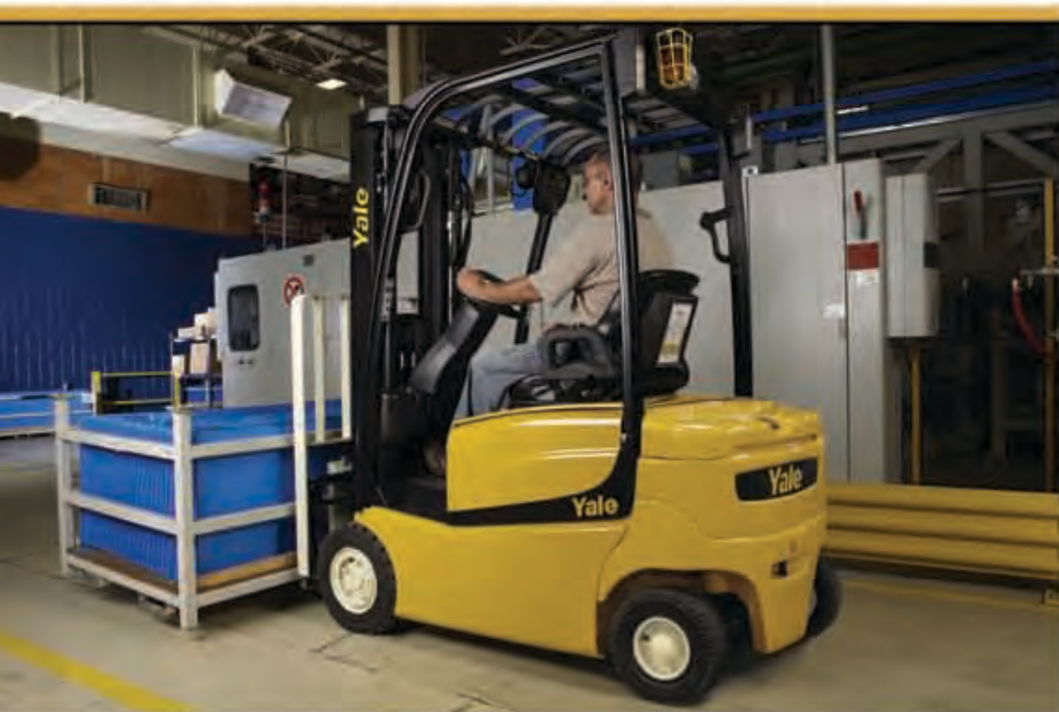
All trucks shown with optional equipment

The purchase price of a truck is only a small part of its overall cost. A lift truck's cost of ownership is the largest portion of dollars spent and includes such elements as periodic maintenance, unscheduled repairs, brakes, and power costs. Yale engineers focused on operating cost savings with reduced maintenance requirements, superior serviceability, enhanced durability, and extended service intervals.