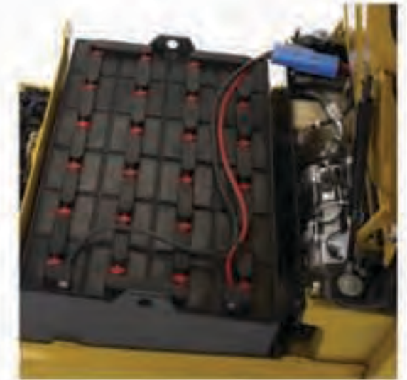
Excellent battery shift life

The unique Power-Assisted Braking system further increases brake and drive train life by automatically utilizing traction motor braking in proportion to operator brake pedal pressure, reducing the demand on the service brakes. The rugged oil-immersed wet disk brakes provide maintenance free operation.