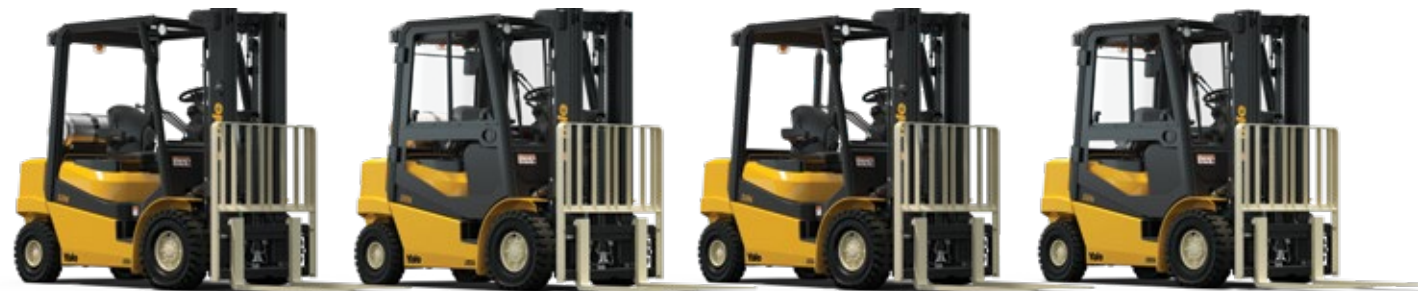
GLP50N - LPG Shown with overhead guard

Proven reliability, durable components and extended service intervals help minimize downtime and reduce maintenance costs.