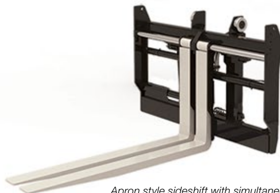
Apron style sideshift with simultaneous and individual fork positioning