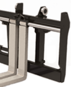
Apron style sideshift

The quad-cooler radiator features four separate cooler cores, packaged so that cool air (not preheated air) is channeled across the cores. Cool overhead air is drawn in for more efficient cooling than in stacked radiator configurations. Louvered cooling fins allow maximum air flow to the radiator.