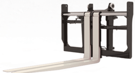
Pin type with individual hydraulic fork positioning