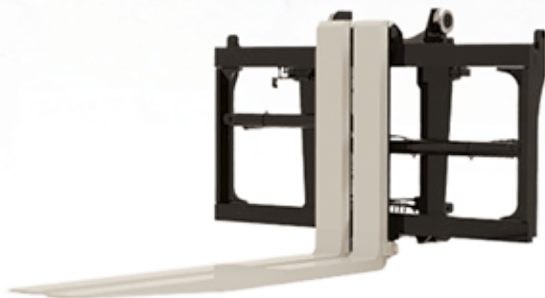
Dual function sideshift fork positioning (DFSSFP)