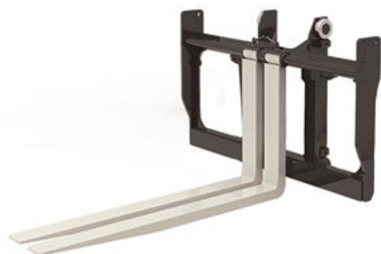
Standard pin type carriage with mechanical fork locks

* Less carriage options are available with provision for base carriages enabling 3rd party supplier attachments