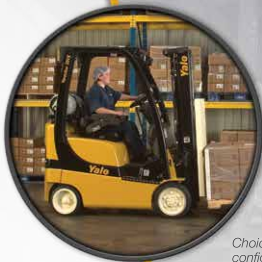
Choice of configurations for standard, medium and heavy duty applications

Two Yale transmission selections are available: the Standard Electronic Powershift and the Techtronix 100. All transmissions feature smooth electronic inching, electronic shift, and neutral start/ brake interlock. The optional Techtronix 100 transmission also provides controlled power reversal which reduces tire spin and conserves fuel, controlled rollback which maximizes control on grades (limiting roll to three inches per second), and Auto Deceleration System (ADS) which reduces brake pedal usage since ADS automatically slows the truck when the operator takes their foot off the throttle pedal. The controlled power reversal and ADS are fully adjustable to meet your application requirements.