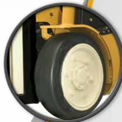
Auto Deceleration System and controlled power reversal available on the Techtronix 100 transmission