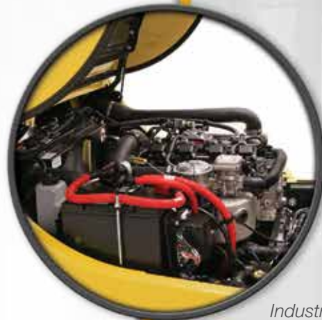
Industrial PSI 2.0L LPG engine