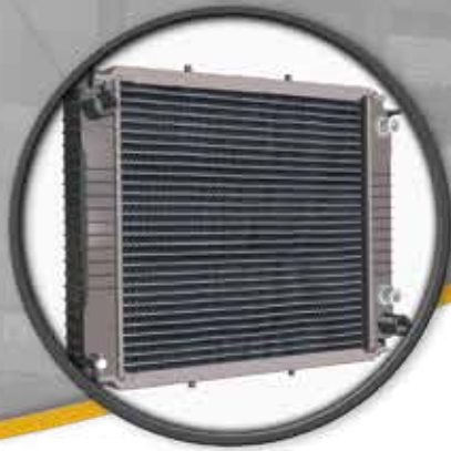
100% shock-mounted anti-clog radiator