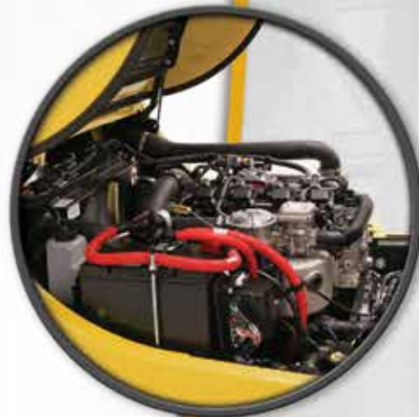
Two engine and two transmission selections are available (PSI 2.4L LPG engine shown)