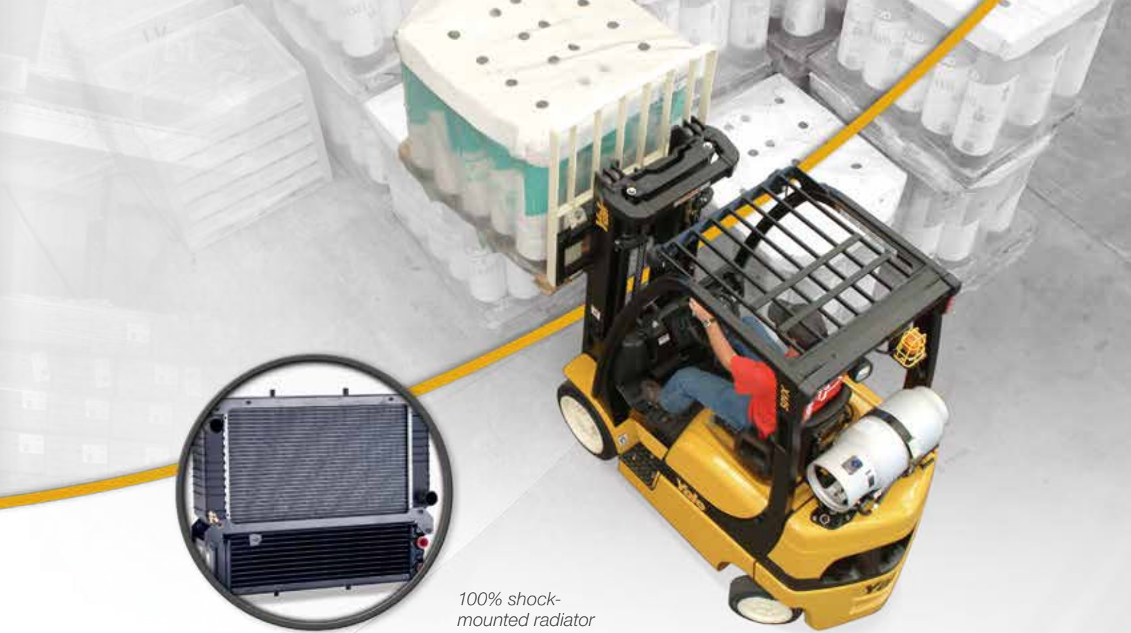
100% shock-mounted radiator