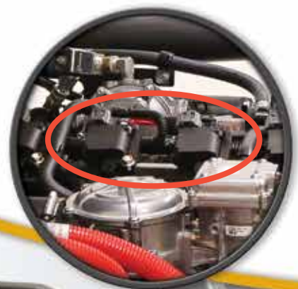
Coil over plug ignition design

The radiator is easy to access. The coolant recovery bottle is easily visible to check coolant levels. A coolant fill neck is located for easy reach.