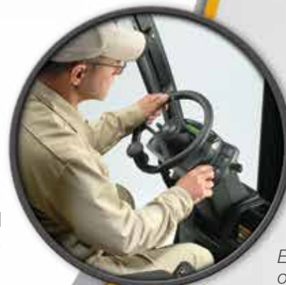
Excellent operator comfort