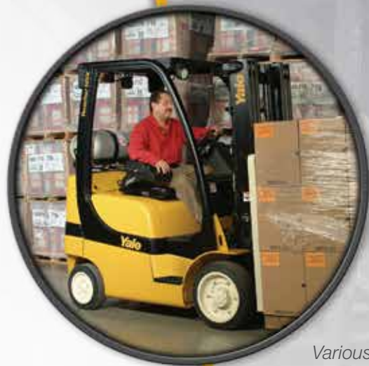
Various truck configurations

The GC040-070VX series of trucks is available in several configurations, designed to meet and exceed your material handling application requirements. The Veracitor® lift truck can be configured for standard, medium and heavy duty applications with state-of-the-art features, enabling superior power for maximum performance. The choices of different configurations allow you to optimize the truck to handle diverse application demands with lowered acquisition cost, and boosting performance while still helping to reduce overall cost of operation.