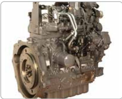
KUBOTA 3.8L DOC DIESEL