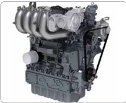
KUBOTA 3.8L LPG