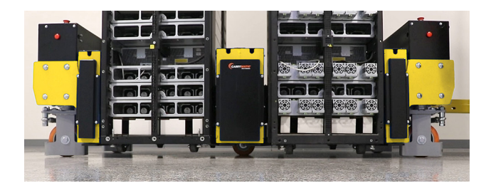
Powered by the automated tugger, the dual bay server racks can lift and lower ORV2/ORV3 data servers for transport.

Each server rack cart has a load capacity of 7,000 pounds, supporting two servers at 3,500 pounds each. The tugger seamlessly connects to the cart through the hitch control mounted on the rear. Server racks are lifted off the ground to help transport safely and securely.