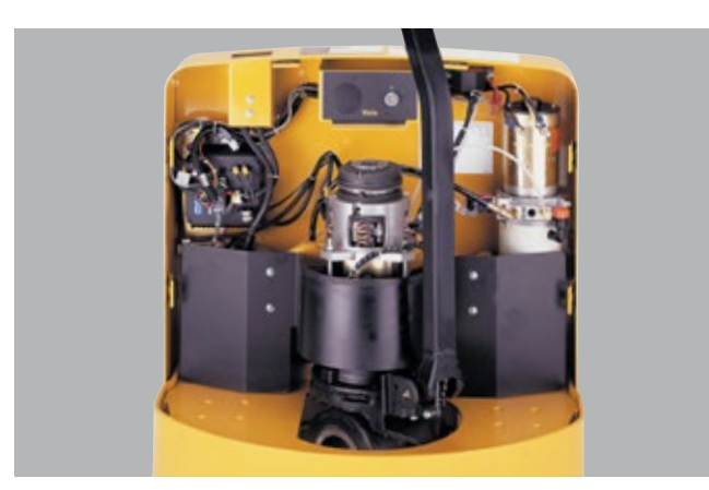
SIMPLIFIED ELECTRICAL SYSTEM

Reduces the need to manually apply a service brake for slow down. The operator simply returns the throttle control towards neutral for a controlled deceleration, reducing fatigue and enhancing productivity.